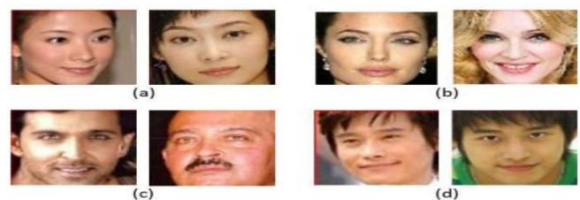
Fig.2. Illustrating inter and intra class variations in kinship classification: (a) similar looking kins,

All human beings are connected to others by blood or marriage. Connections between people that are traced by blood are known as consanguineous relationships. Relationships based upon marriage or cohabitation between collaterals (people treated as the same generation) are affinal relationships. Humans being have the capability to recognize family members. Phrases such as “neha has his father’s nose” or “sohail has her mother’s eyes” are quite common. This statement motivates us by this we consider the following question: Is it possible to develop a method to extract the salient familial traits in face images for kinship recognition? If this idea works, software can be developed to measure familial relationships. This computational kinship measurement might have large impact in real world applications such as child adoptions, trafficking/smuggling of children and finding missing children. The problem is related to but is very different from traditional face recognition problem since we need to find subtle features that are reliable across a large span of ages and sex difference.